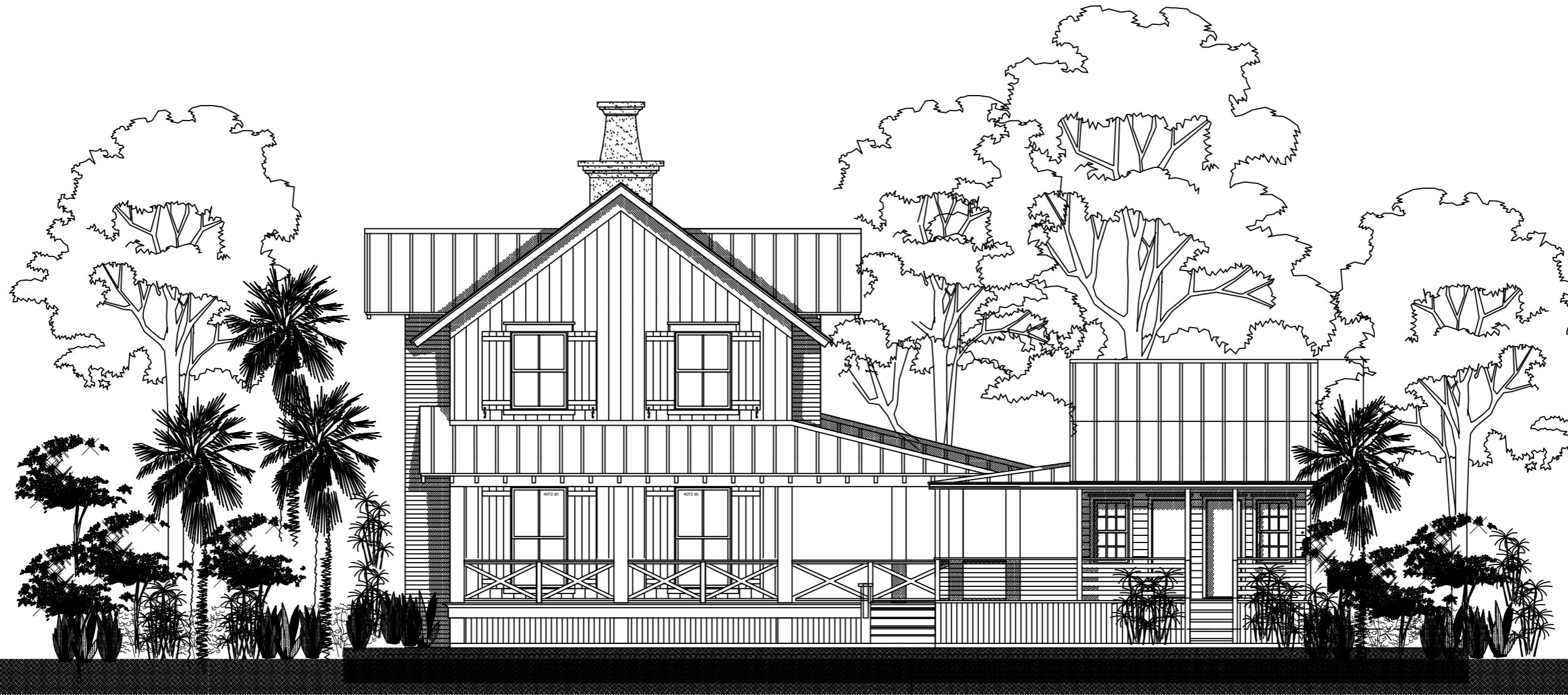
"SQUEEZE INN" 2824 BROOKS STREET SULLIVAN'S ISLAND